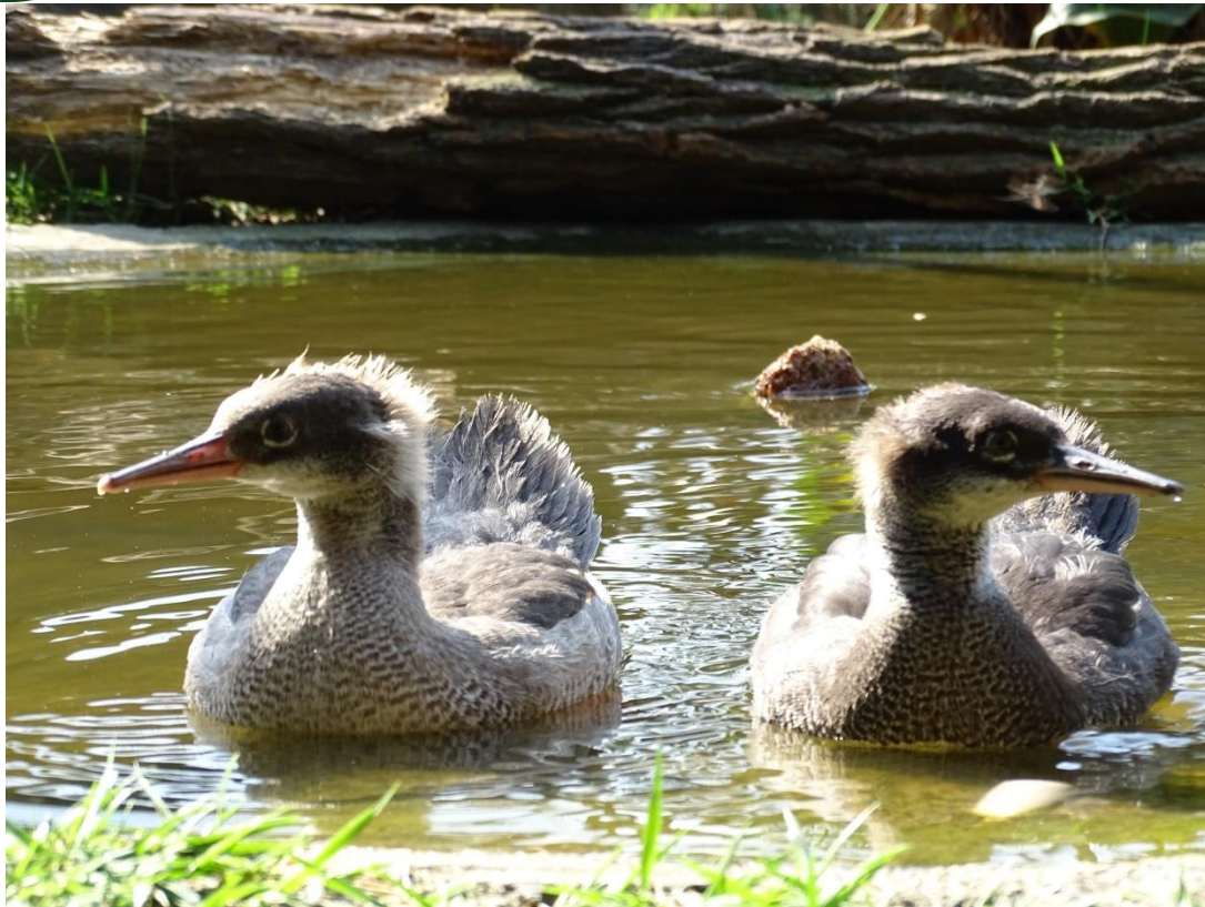
Picture 4 - Taken on September 16th, hand raised birds

So today we have a total of 30 birds (13.14.3) and one female sitting on eggs (Picture 2)! With almost all the females laying eggs it is a very promising and positive signal for next year!