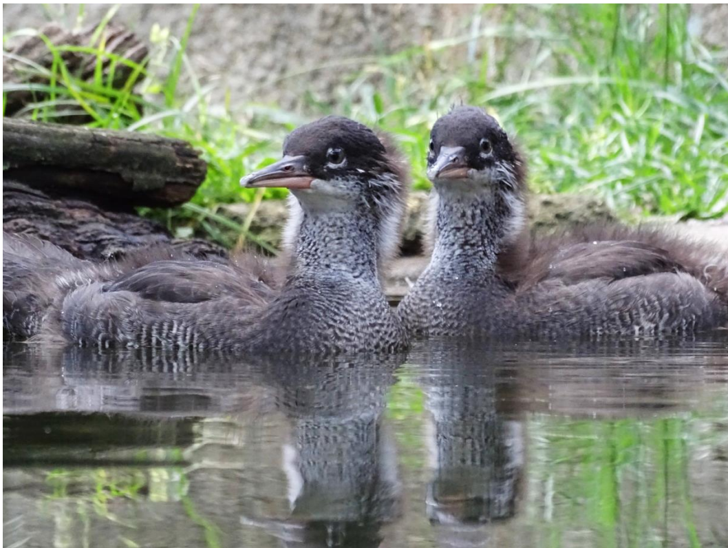
Picture 3 - Taken on October 8th, birds raised by the parents