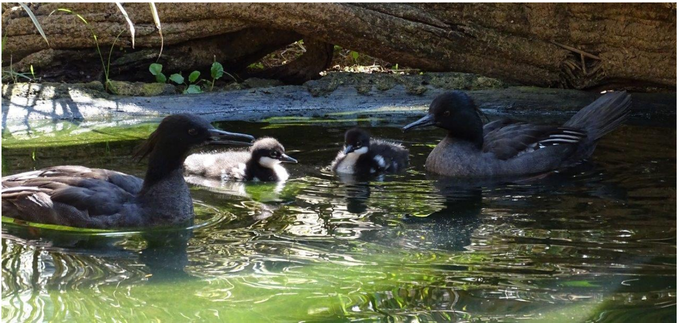
Picture 1 – Female 2011 from Serra da Canastra and male 2014 from Patrocínio raising 2 youngsters (sex unknown)

This year we had a very strange breeding season!